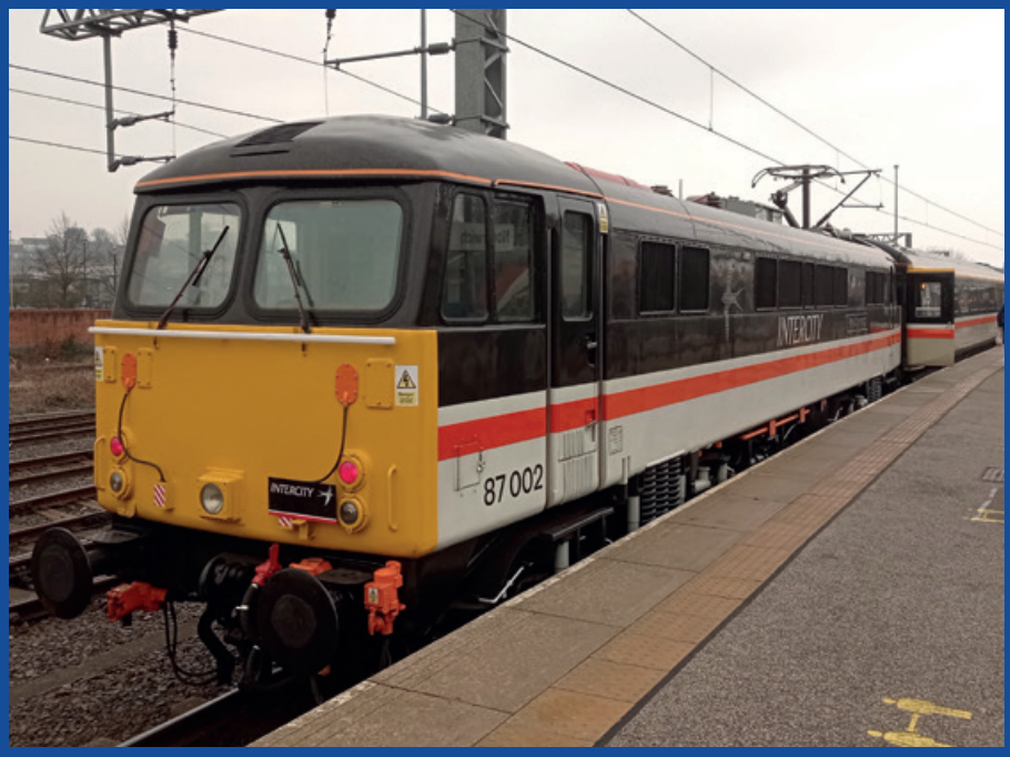
87002 Royal Sovereign is depicted preparing to depart from Norwich on 16/3/22.