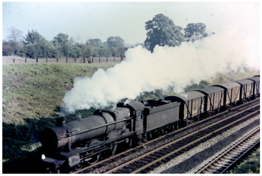
GWR No. 6903 Belmont Hall, in begrimed condition, is depicted with an Up freight train on Hatton Bank, 14/10/1961.