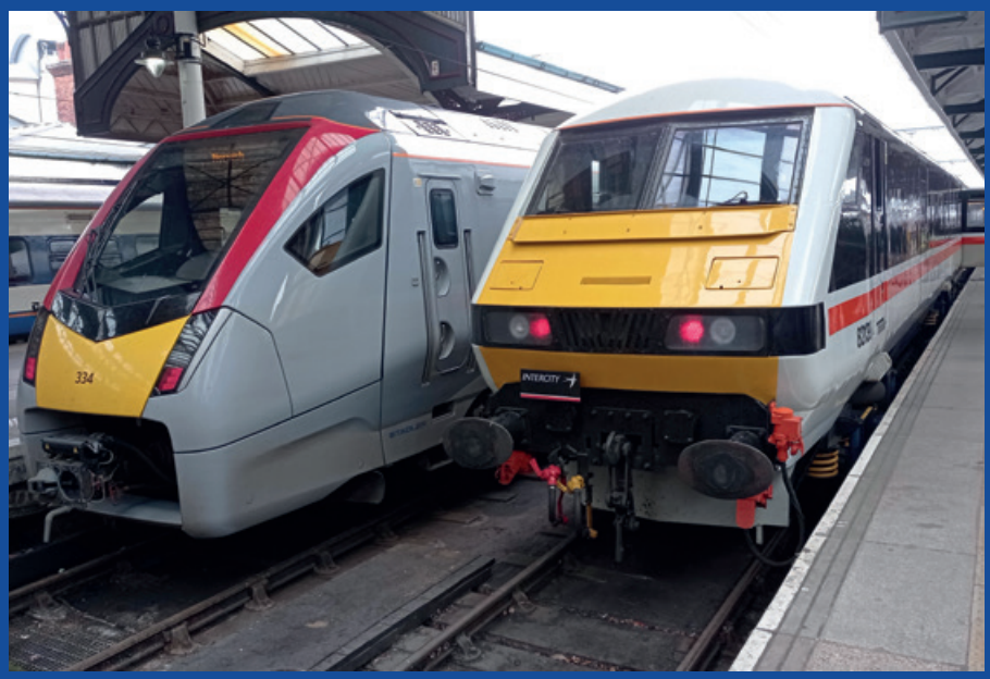
On 16/3/22, the DVT included in the formation of the special train described in Chris Lewis' essay is seen at Norwich alongside a more modern example of motive power.