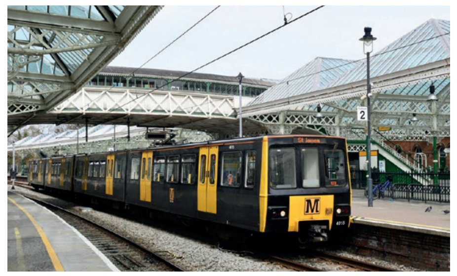
On the Tyne & Wear Metro at Tynemouth Station, a Newcastle bound Metro train is about to depart on 28/4/22. This station was originally opened in 1882 to the design of the North Eastern Railway (NER) architect William Bell. The glass canopies over the running lines and former bay platforms are intact and present a wonderful sight. The line was electrified by the NER in 1904 and as such is claimed as the world's first suburban electrified railway. It only costs £5.70 for an all-lines off-peak rover ticket on the Metro. By modern standards, compared to say Germany, the trains are basic, rattling and noisy and therefore somewhat outmoded. On the other hand they run at frequent intervals, around 10 - 12 minutes each, and are relatively cheap. However most of the better off residents have long migrated to outer suburbs and villages which these trains don't reach.