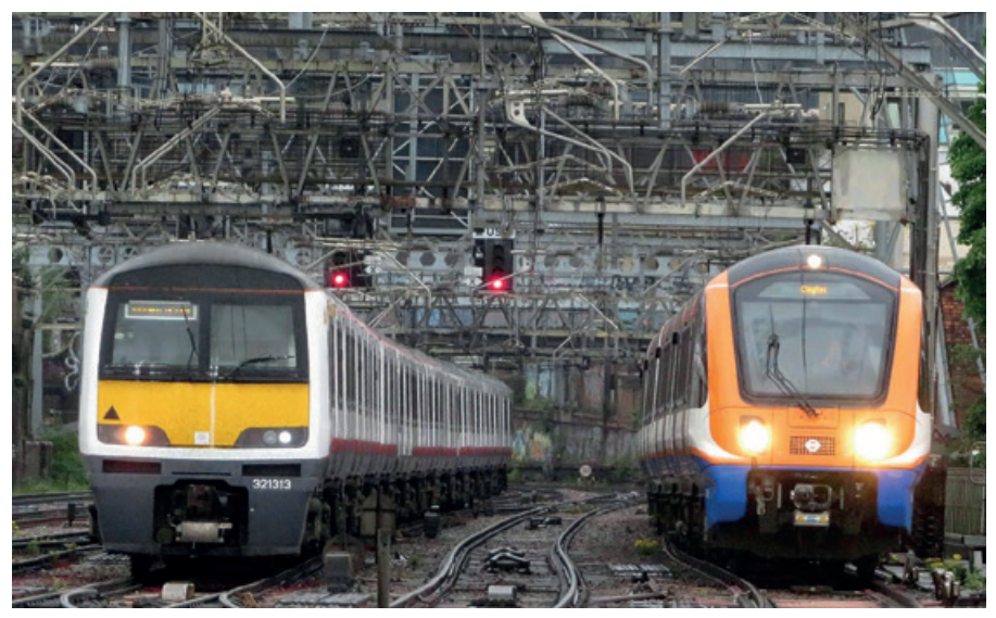
A Cl. 321 on a Southend service neck and neck with a Cl. 710, seen on 11/5/22. How the North must envy the lavish length of trains in and out of the Capital. Even with new stock, a 4 car is a long train around Liverpool, Manchester and Leeds.