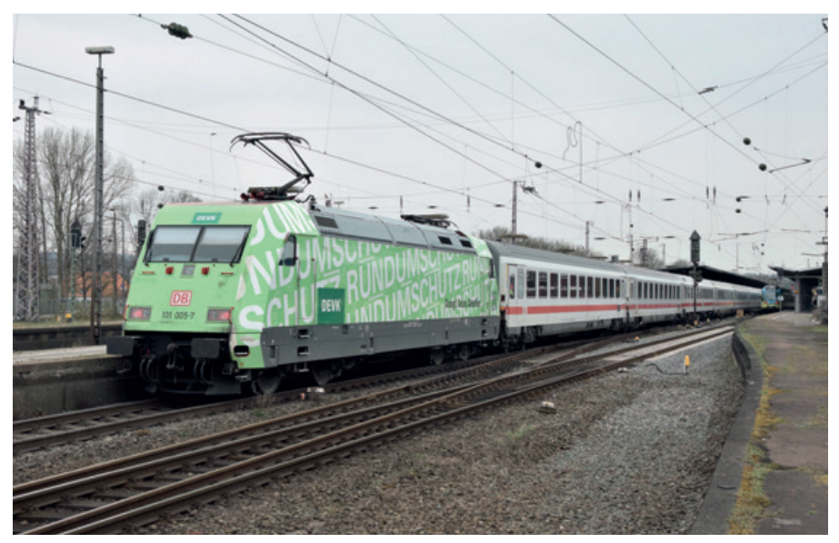
Germany. 101 005 is pictured at the rear of IC 2213 from Binz to Stuttgart on 31/3/22. The line ahead is blocked and the train must reverse and go via Rheine.