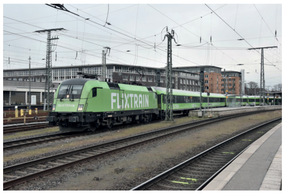
Germany. 182 515 in FLIX colours is leaving Bremen Hbf with the 14.10 Köln – Hamburg Flix Express on 31/03/2022.