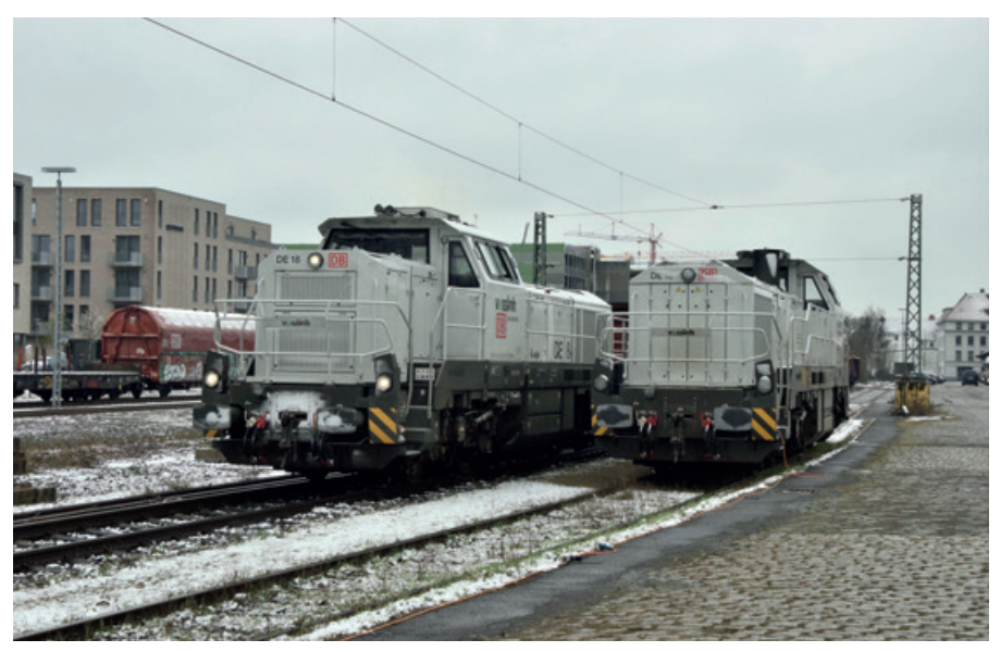
Germany. On the other side of the main line to the stabling point is the Oldenburg goods yard where the two pilots are DB leased 4185 041/45. Seen on 31/03/2022.