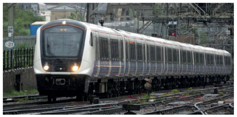
I haven't been able to get around as much as I like of late but for a starter George Howe (of Potton Station fame) recommended Bethnal Green as a good place to see all the new EMUs now running on former Great Eastern Lines. Some of the older trains are still running; 317 and 321 units came through together with 345 units on the Shenfield services which were scheduled from the 24th May to no longer pass by, instead, they will be running to Liverpool Street, as part of the much delayed Elizabeth Line. Shame it was raining on 11/5/22, when this Cl. 345 on a Shenfield service headed up the climb out of Liverpool Street.