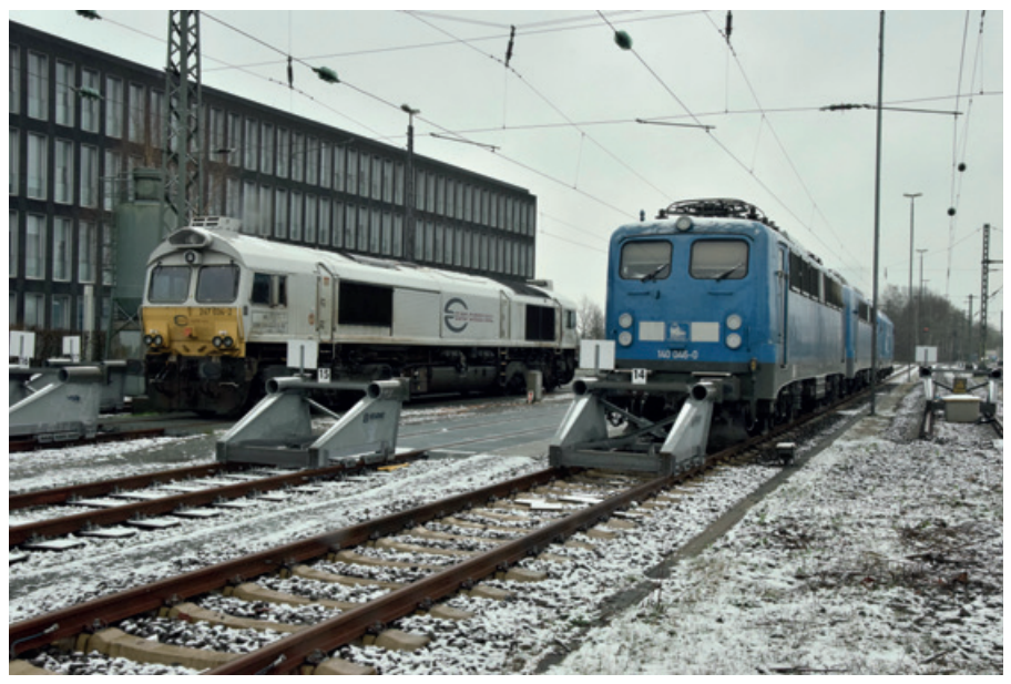
Germany. The relatively new stabling point at Oldenburg has on view Euro Cargo Rail 247 034 and Press 140 042 (ex-DB 140 834) on 31/03/2022.