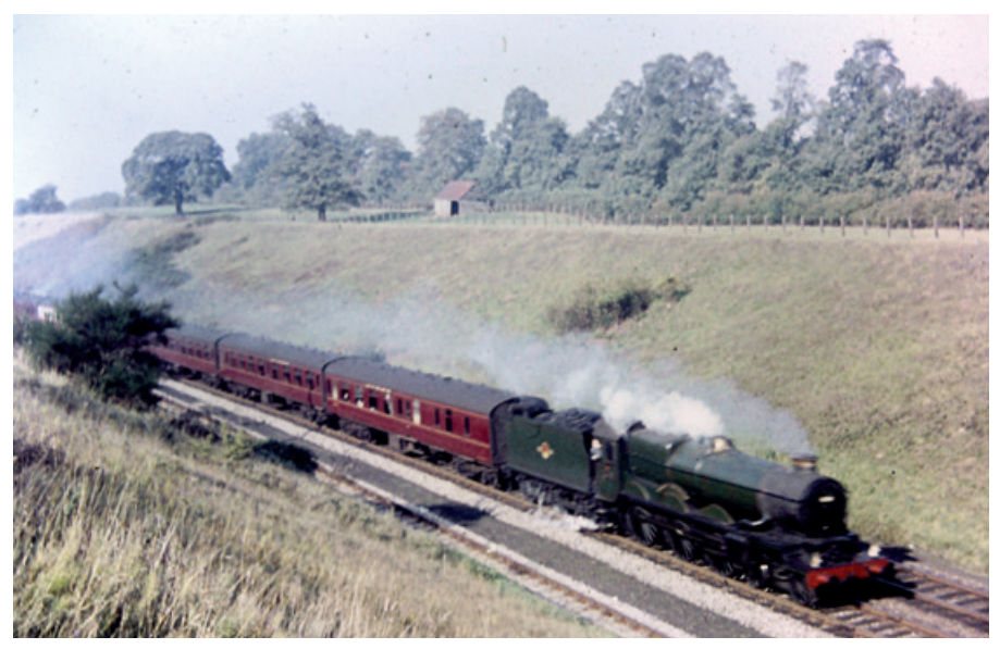
A second GWR 4-6-0, No. 5001 Llandovery Castle, approaches the summit of Hatton Bank on 14/10/1961 with a passenger train bound for Shrewsbury.