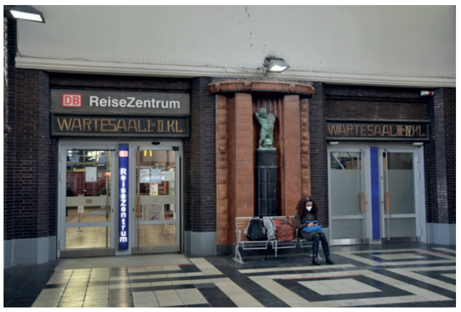
Germany. Oldenburg station has preserved the notices above the old waiting rooms. Note that there are four classes of passengers shown. Depicted on 31/03/2022.